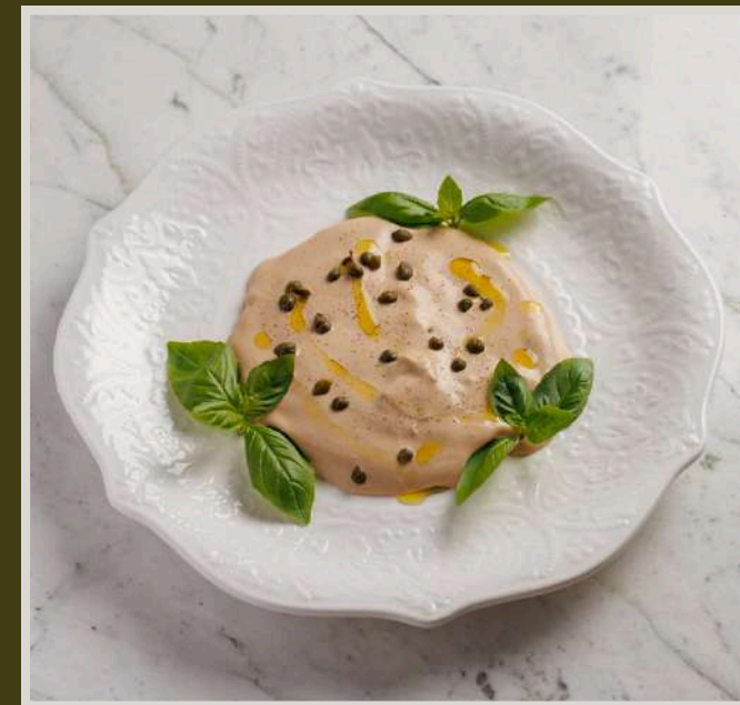
ROASTED PEPPERS, ARTICHOKE CARPACCIO, TONNATO