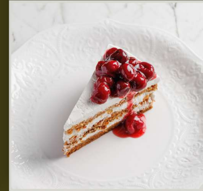
CARROT CAKE WITH COCONUT YOGURT