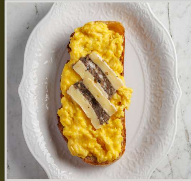
SCRAMBLED EGGS, TRUFFLE BRIE