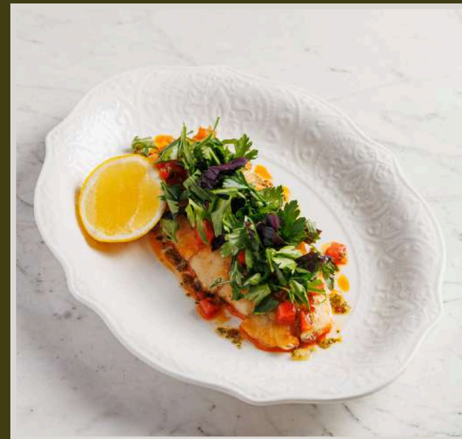
WHITEFISH IN SICILIAN STYLE