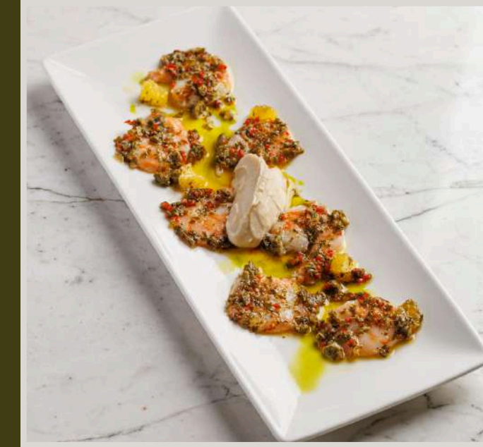
SHRIMP WITH ARTICHOKE HUMMUS