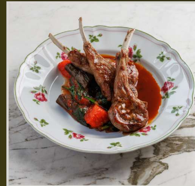
LAMB RACK, SPINACH