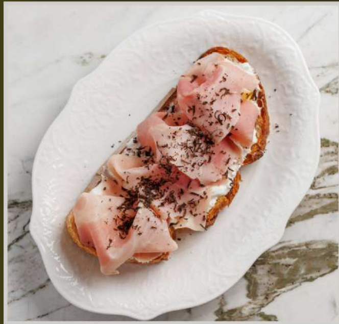
PROSCIUTTO COTTO, STRACIATELLA