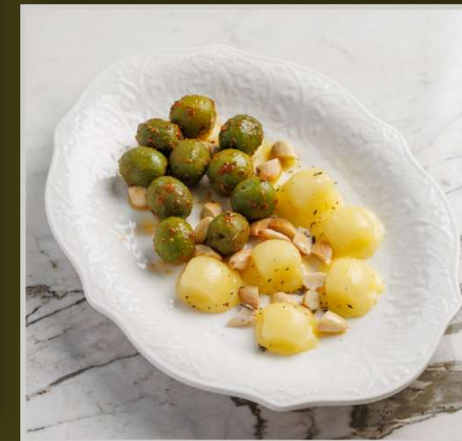
OLIVES WITH PROVALONE