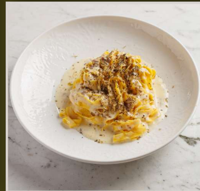
TAGLIOLINI WITH TRUFFLE