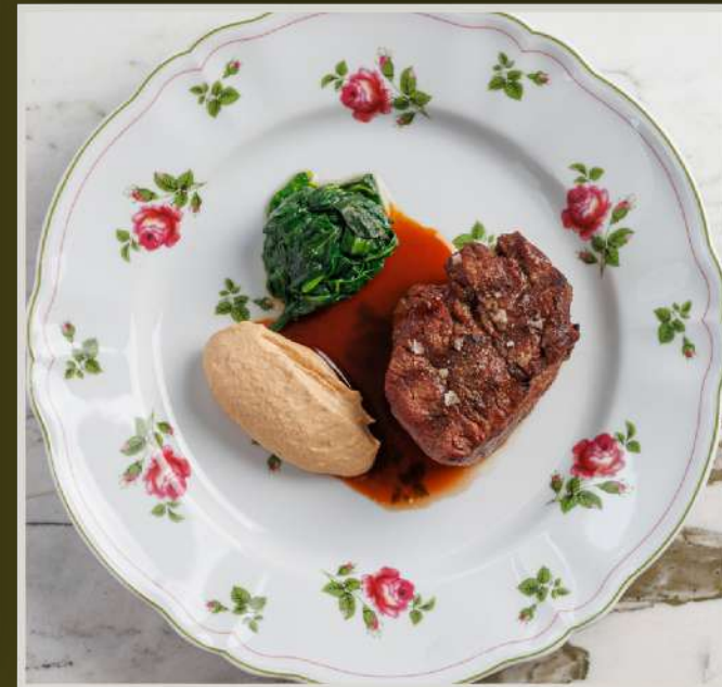
FILET MIGNON, TONNATO SAUCE