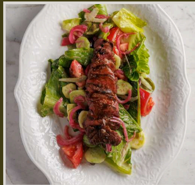
SALAD WITH VEAL AND NUT DRESSING