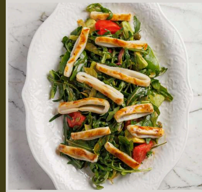
SALAD WITH GRILLED SQUID