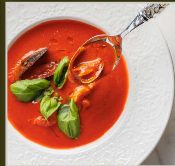
TOMATO SOUP WITH SEAFOOD