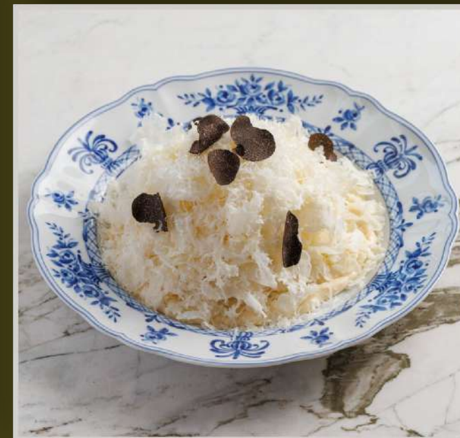
CAULIFLOWER CARPACCIO, PARMESAN, TRUFFLE