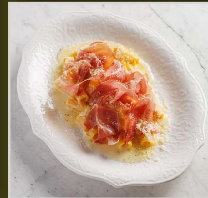
RIGATONI WITH PARMA HAM