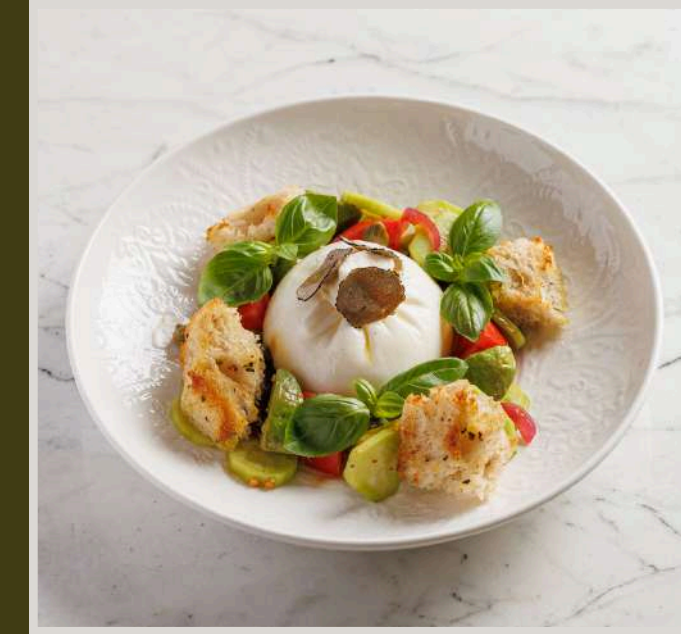
PANZANELLA WITH TRUFFLE BURRATA