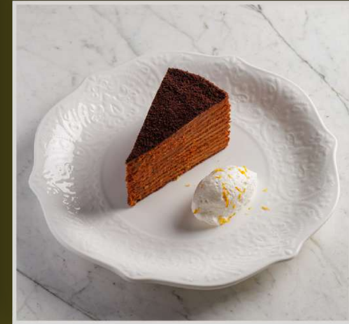
CAKE WITH CANDIED AND CHOCOLATE