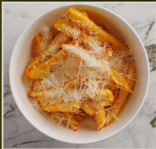
FRENCH FRIES WITH PARMESAN