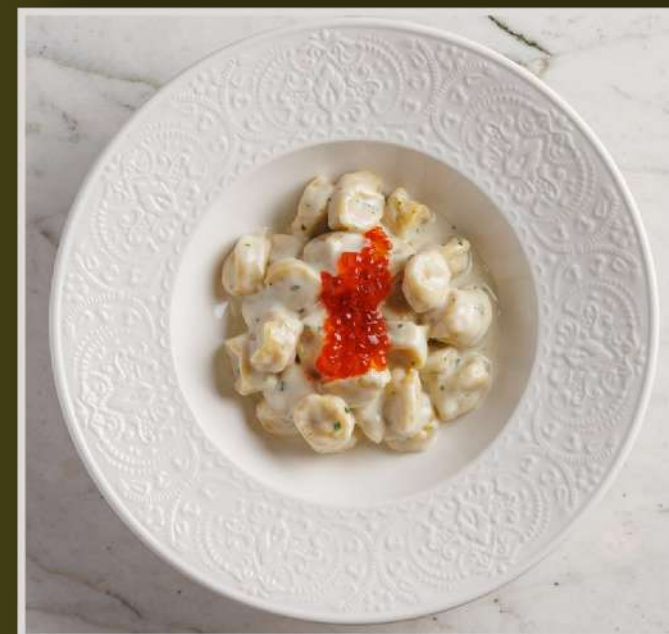
GNOCCHI 4 CHEESES, RED CAVIAR