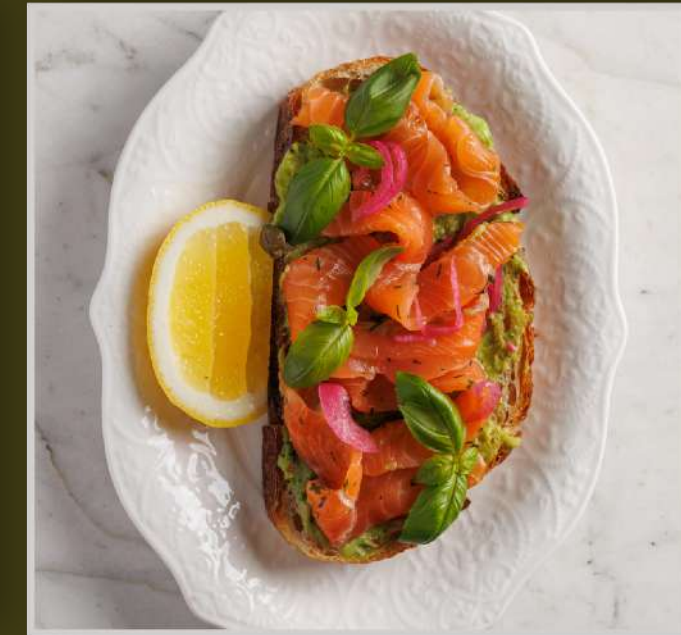
SALMON AND AVOCADO