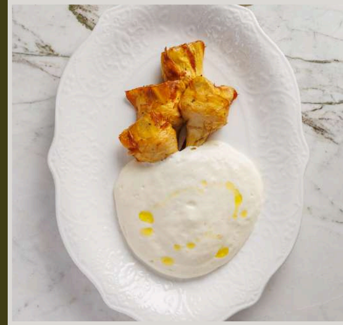
ARTICHOKE WITH PECORINO