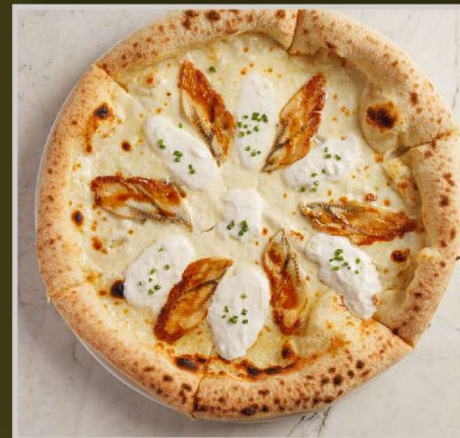
ELL AND STRACCIATELLA