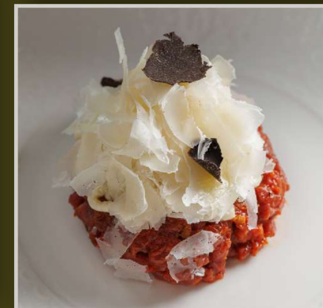
BEEF TARTARE ITALIAN STYLE