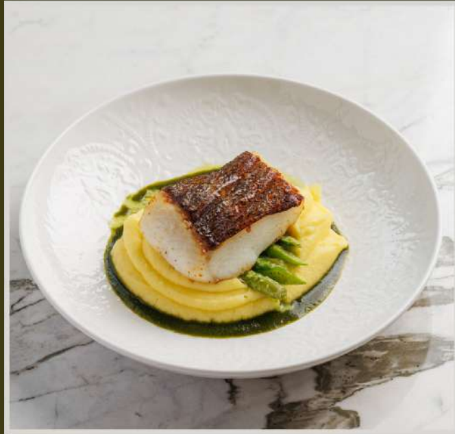
HALIBUT WITH MASHED POTATO, ASPARAGUS