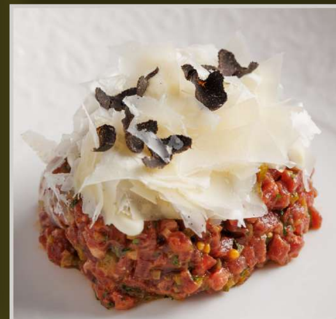
BEEF TARTARE FRENCH STYLE