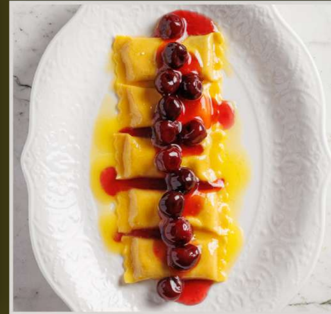
RICOTTA DUMPLINGS WITH CHERRIES