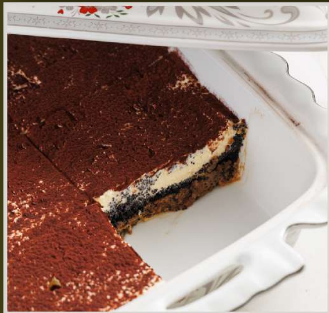
POPPY SEED TIRAMISU