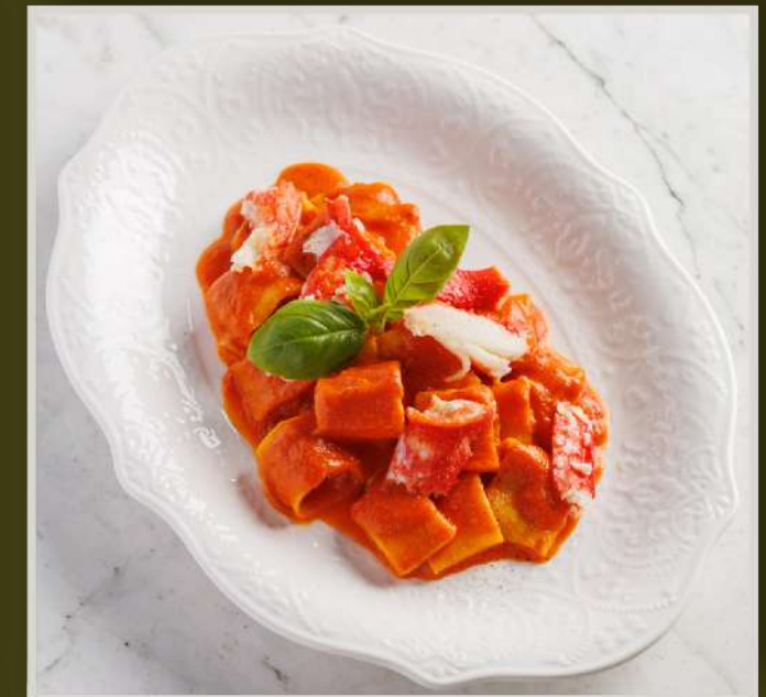
KALAMARATA WITH CRAB