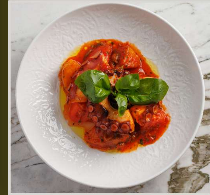
OCTOPUS IN SICILIAN STYLE