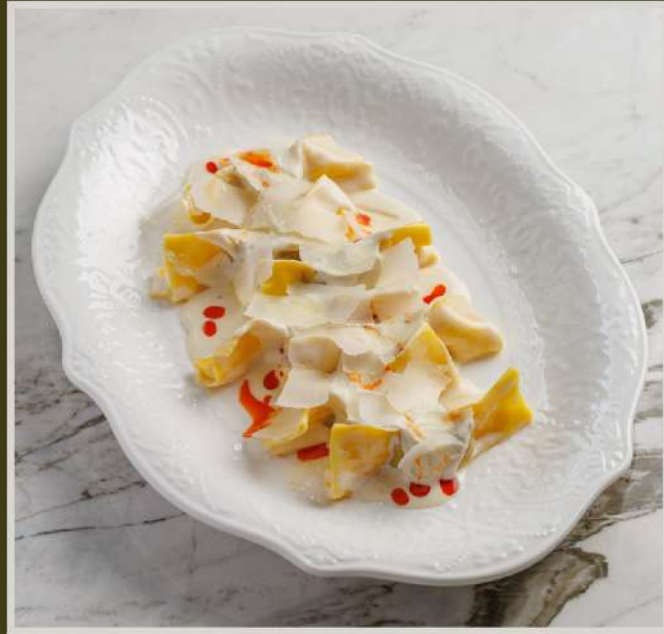
RAVIOLI WITH LAMB, PARMESAN