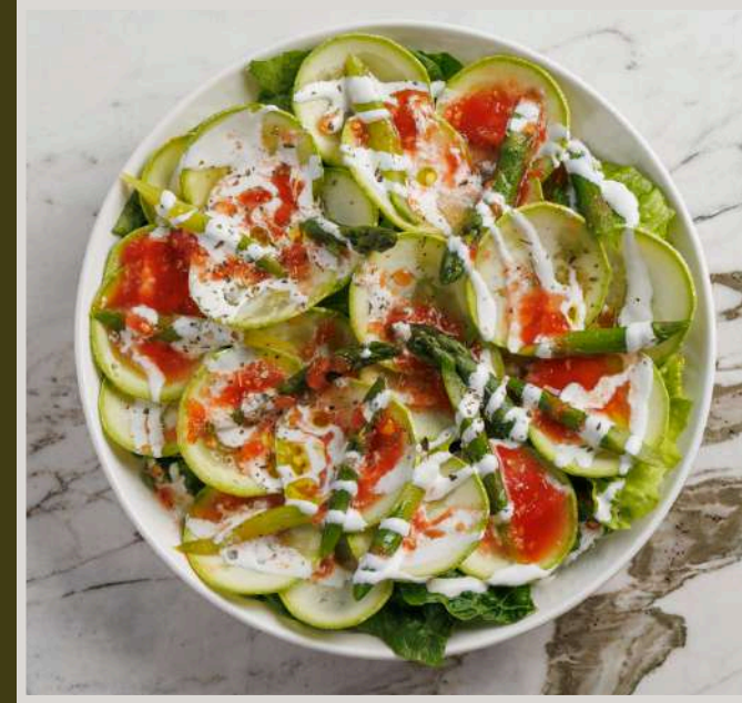
SALAD ALA POMODORO, ZUCCHINI, ASPARAGUS