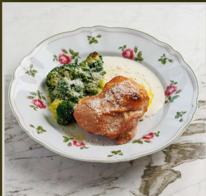
CHICKEN, BROCCOLI, GORGONZOLA SAUCE