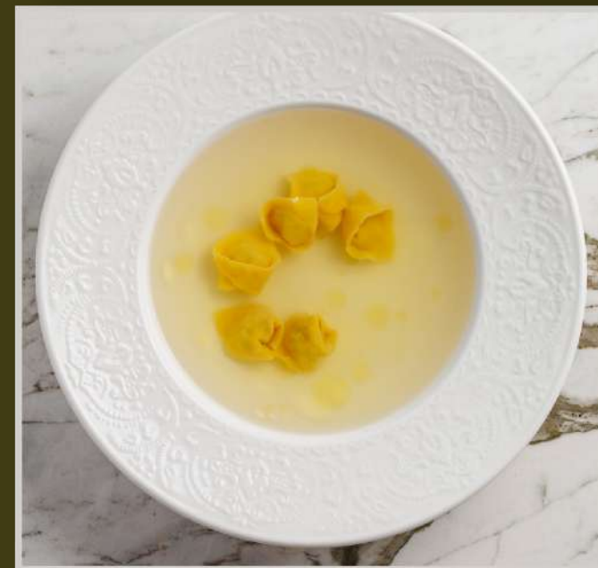
CHIKEN BROTH WITH TORTELLINI