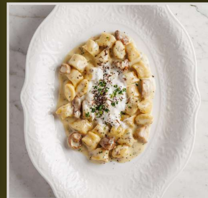
GNOCCHI WITH PORCINI MUSHROOMS, STRACCIATELLA, TRUFFLE