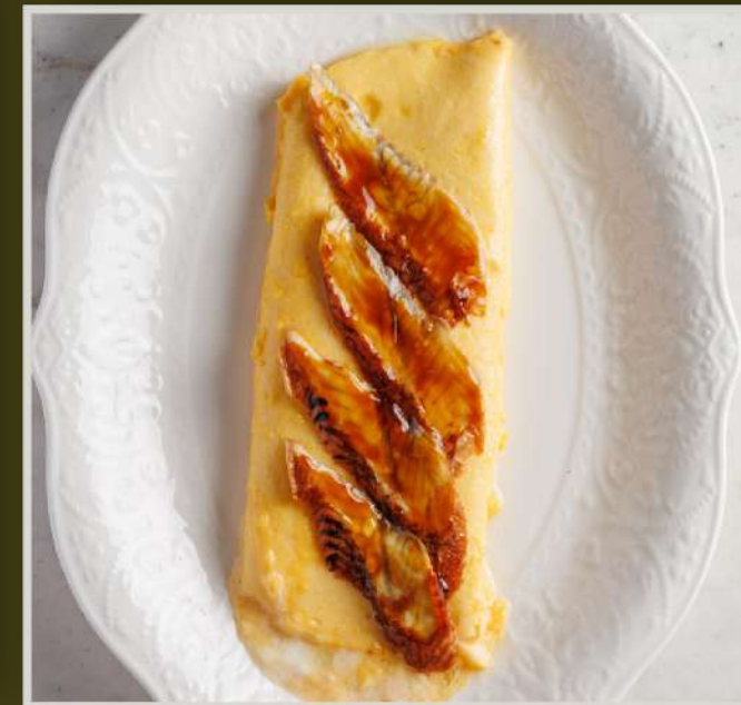
OMELETTE WITH STRACCIATELLA AND ELL