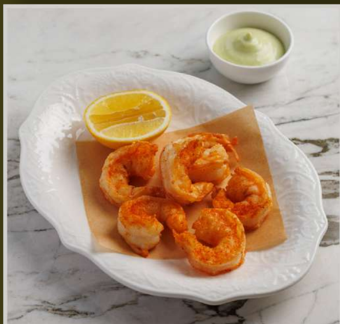
SHRIMP FRITTO MISTO