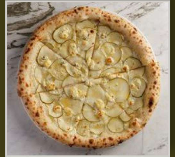
GORGONZOLA AND PEAR