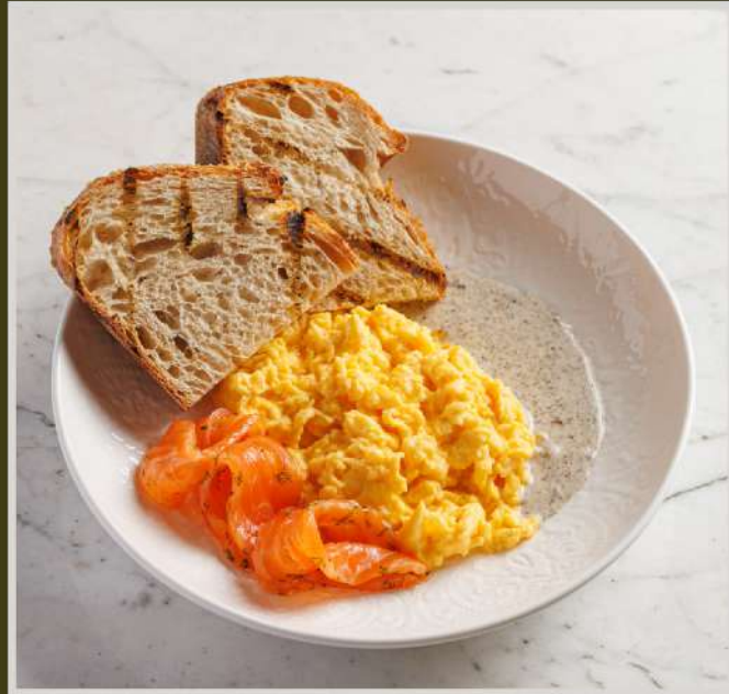
ROYAL WITH SALMON, TRUFFLE SAUCE