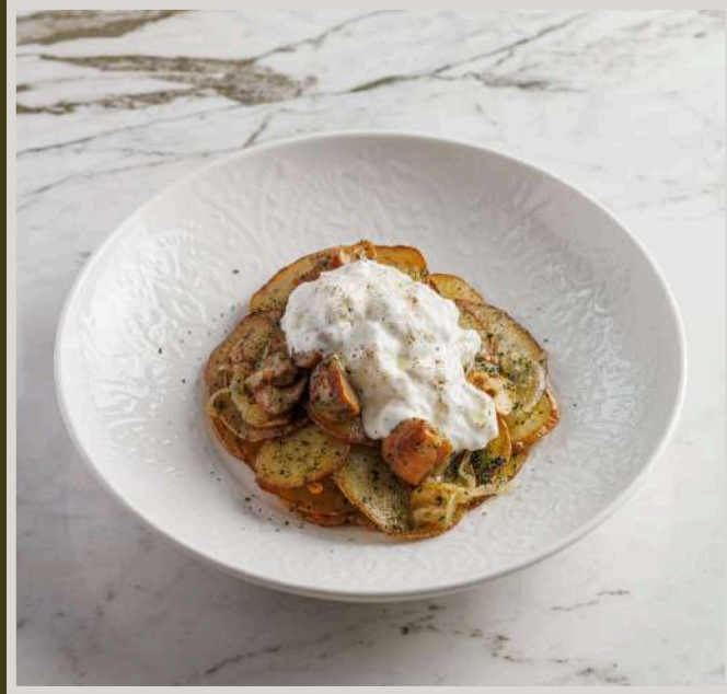
PATATA AL TARTUFO, PORCINI MUSHROOMS