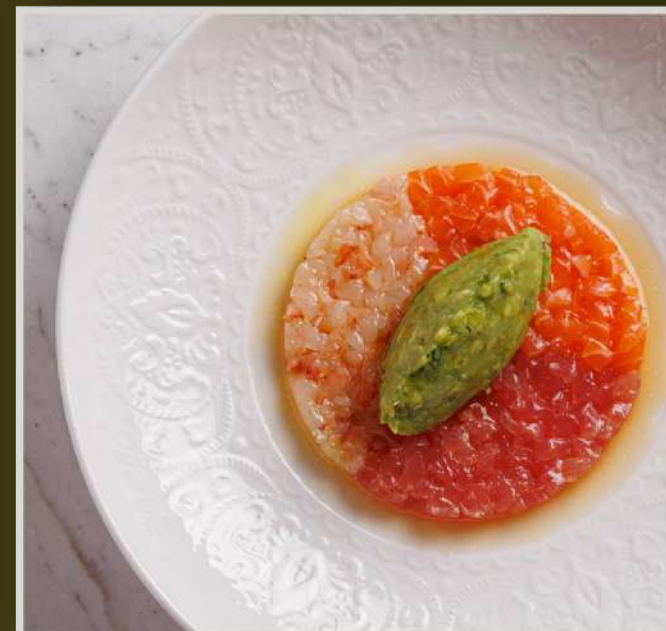
TARTARE ASSORTIMENT: SALMON, TUNA, LANGOUSINE