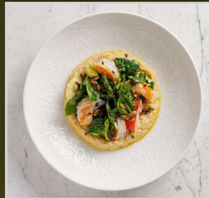
HUMMUS, SHRIMPS, VEGETABLES