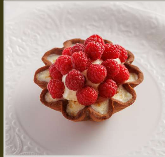
TORTA AL FORMAGGIO