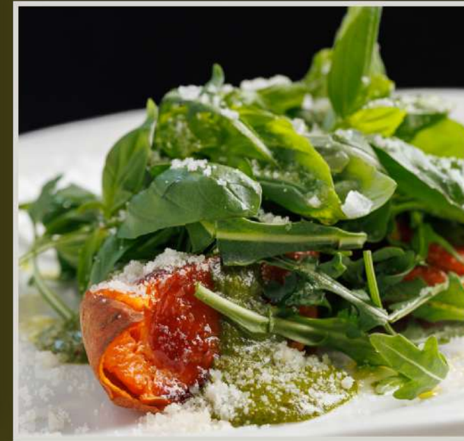
SWEET POTATO, PESTO, PARMESAN