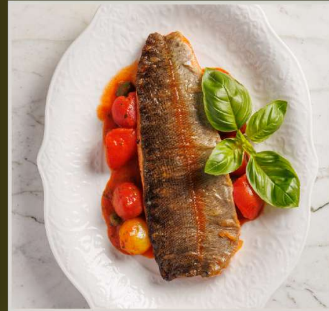
TROUT, OLIVES AND TOMATOES