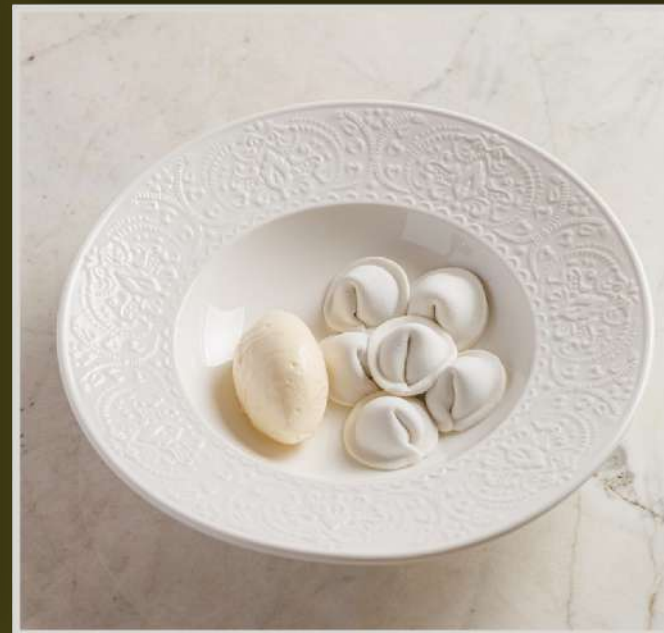
ALMOND TORTELLINI DULCHE DE LECHE