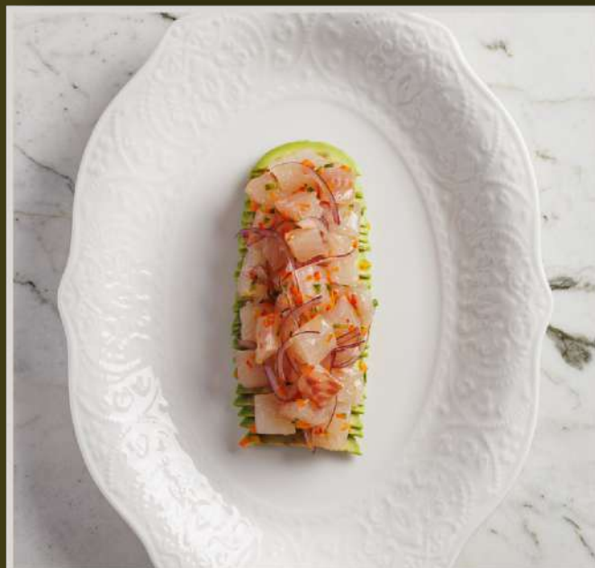
SEVAN WHITEFISH, GREEN PEPPER