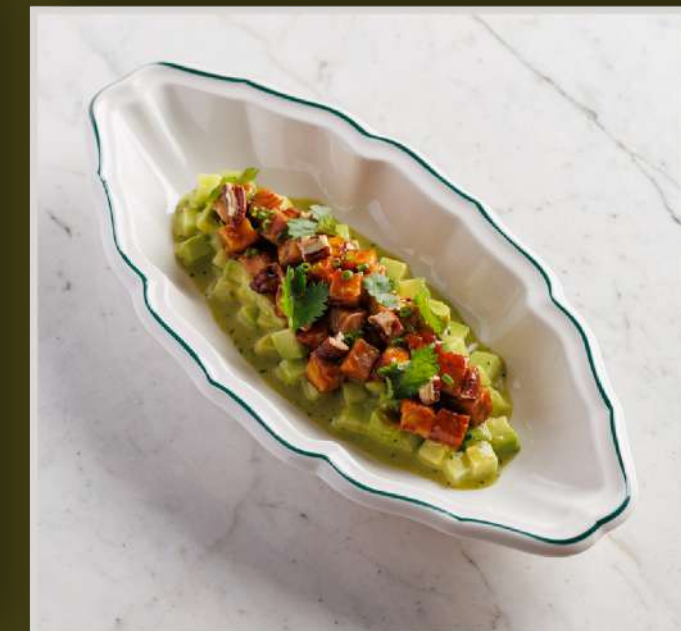
SMOKED EEL TARTARE, AVOCADO