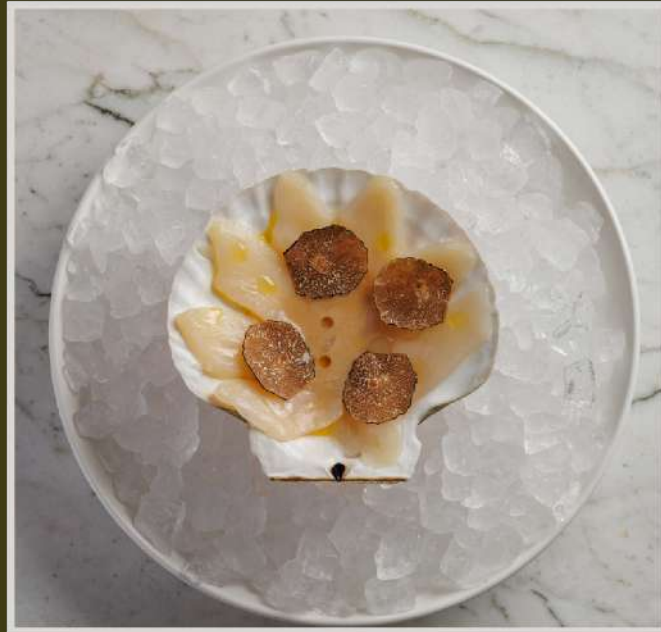
SCALLOP CARPACCIO, TRUFFLE