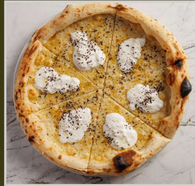
CACIO E PEPE, BURRATA, TRUFFLE