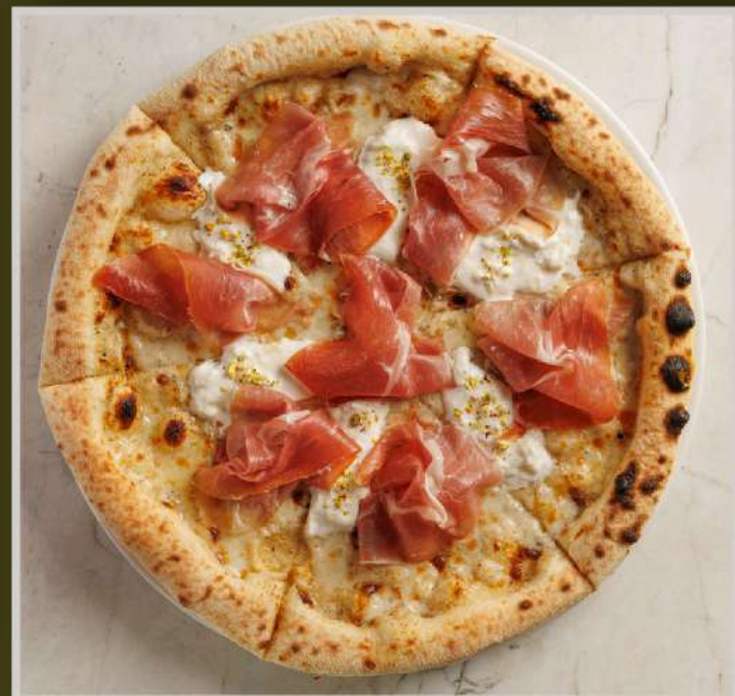
PARMA HAN AND SRTACCIATELLA