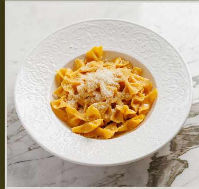
FARFALLE CACIO E PEPE