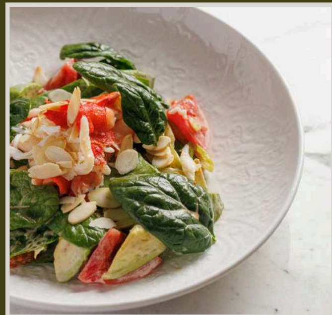
SALAD WITH KAMCHATKA CRAB