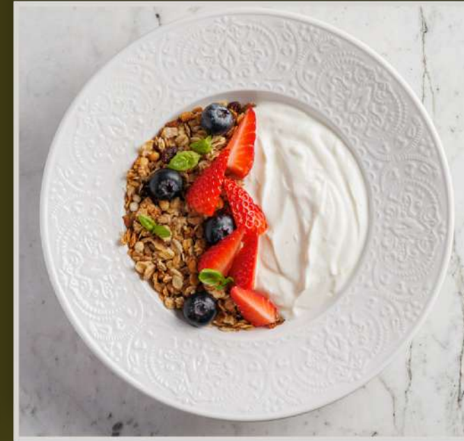
GRANOLA WITH GREEK YOGURT, BERRIES