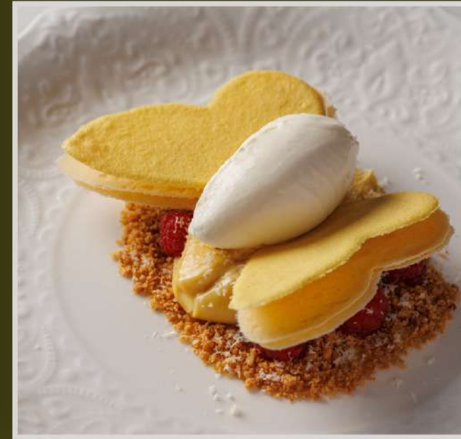
MANGO-PASSION FRUIT GANACHE, RASPBERRIES, GORGONZOLA