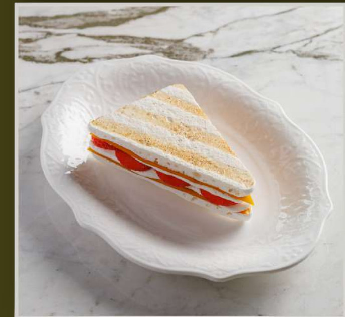
PAVLOVA WITH MANGO AND STRAWBERRIES