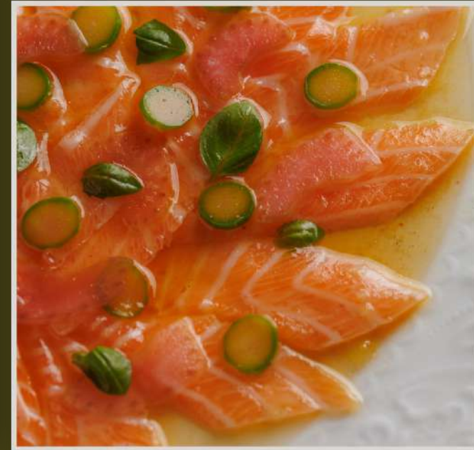
SALMON CARPACCIO, LEMON DRESSING, ASPARAGUS