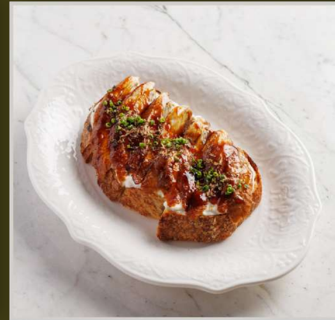
SMOKED EEL, STRACIATELLA, TRUFFLE