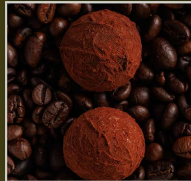
CHOCOLATE CANDIES WITH AMARETTO