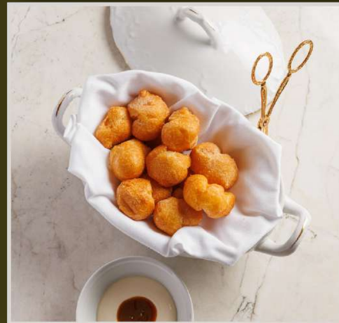
FRITELLE WITH SALTED CARAMEL