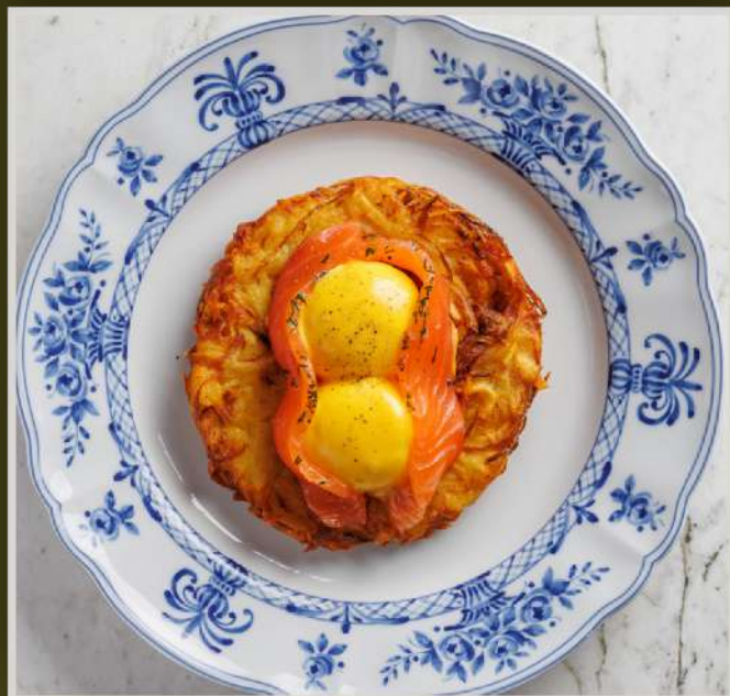
POTATO PANCAKE, SALMON, POACHED EGGS