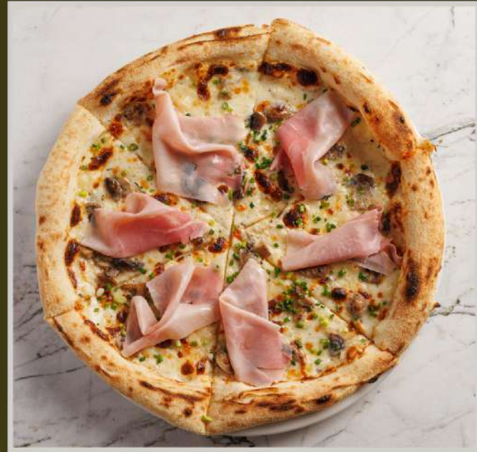
HAM AND MUSHROOMS