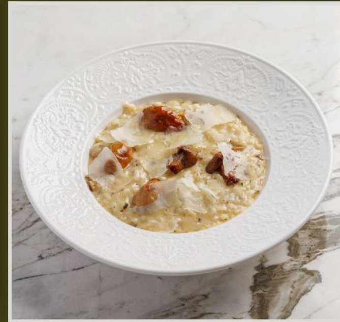
RISOTTO WITH PORCHINI MUSHROOMS