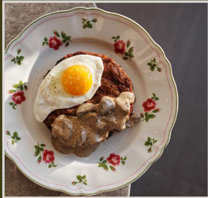
COUNTRY-STYLE BEEF CUTLET, EGG, MUSHROOM SAUCE