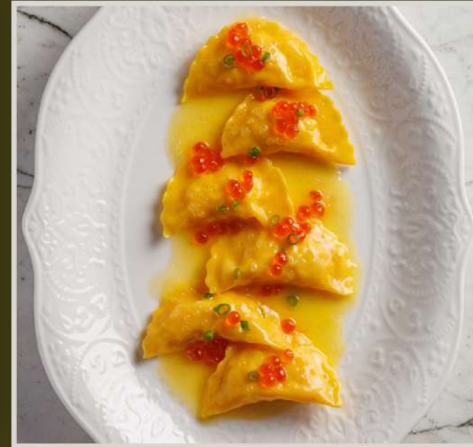
DUMPLINGS WITH CRAB, RED CAVIAR