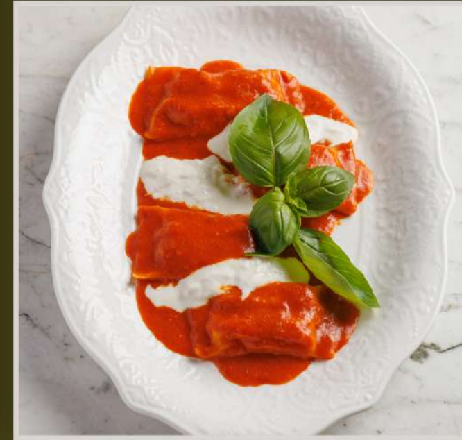
RAVIOLI WITH CRAB, STRACCIATELLA