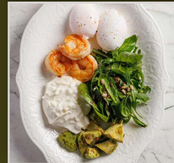
BREAKFAST 'HEALTHY LIFESTYLE'