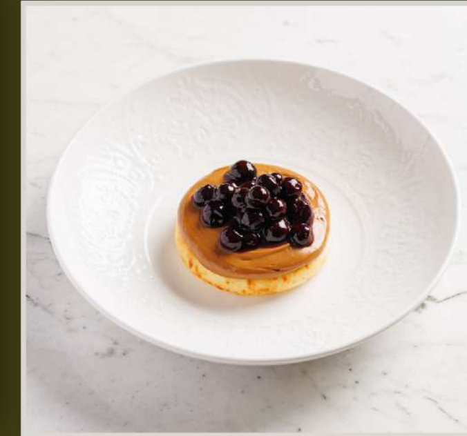
RICOTTA CHEESECAKE WITH COTTAGE CHEESE CREAM