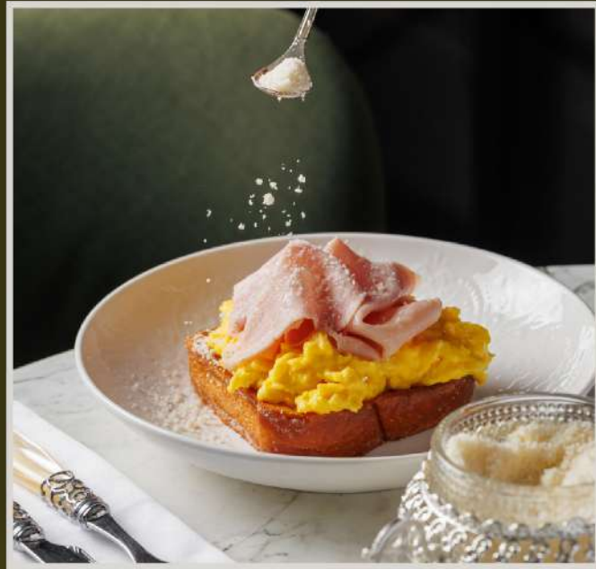
SCRAMBLED EGGS, PROSCIUTTO, PARMESAN