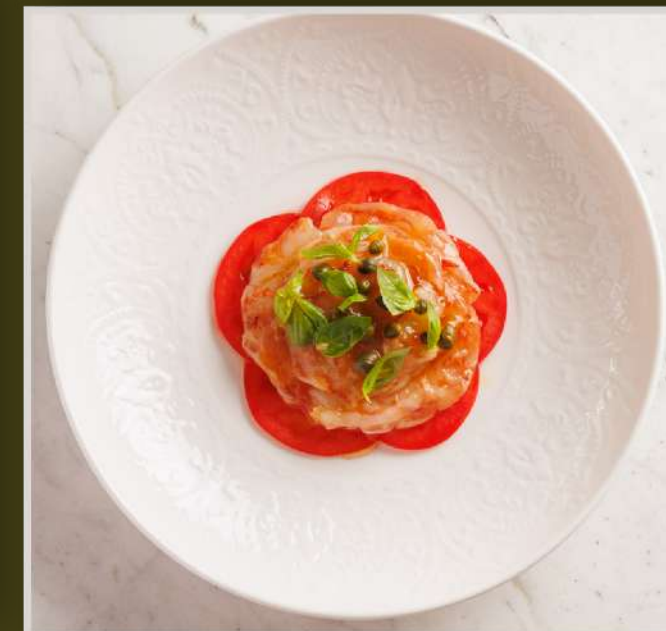
LANGOUSINES, TOMATOES, LIME