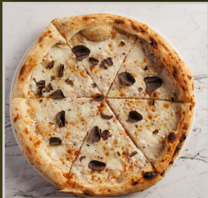
A LA TARTUFO