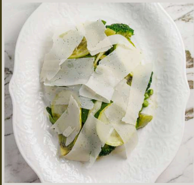
GREEN SALAD LOONA