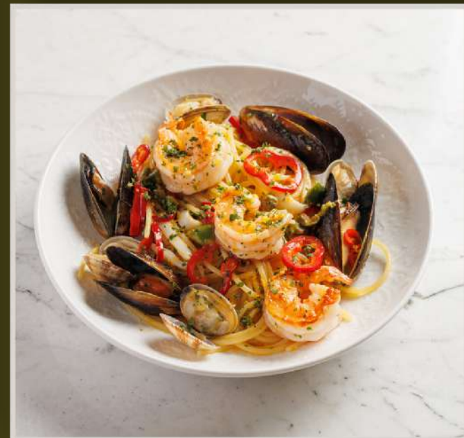
SPAGHETTI WITH SEAFOOD