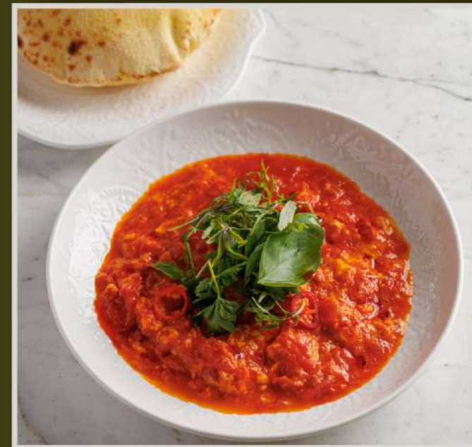
FRIED EGGS WITH TOMATOES