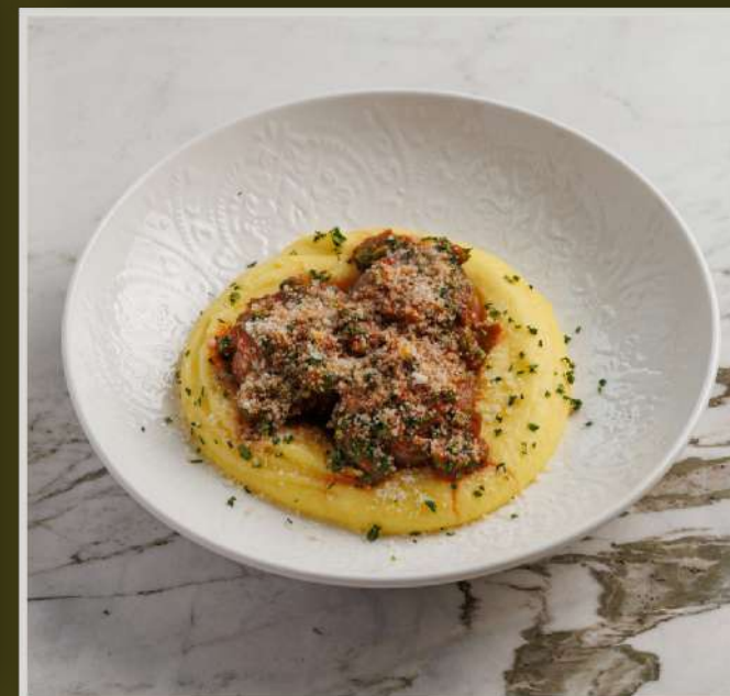
LAMB CUTLETS, MASHED POTATOES, PARMESAN