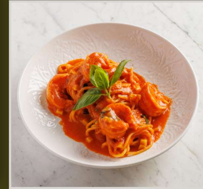
ARRABIATA WITH SHRIMPS