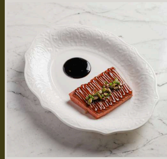
GUINEA FOWL PATE, APRICOT SAUCE