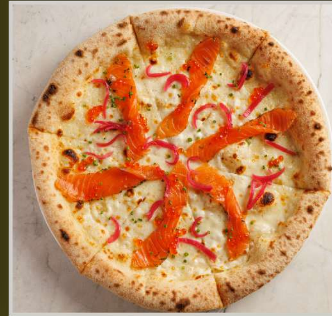
SALMON, RED CAVIAR