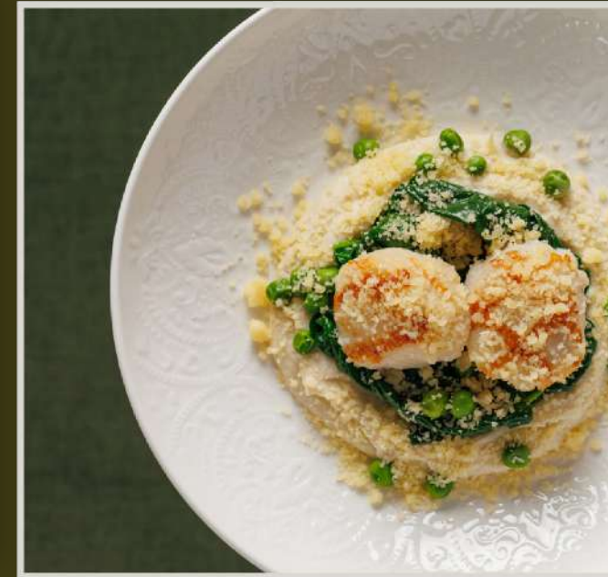
SCALLOPS WITH CAULIFLOWER PUREE