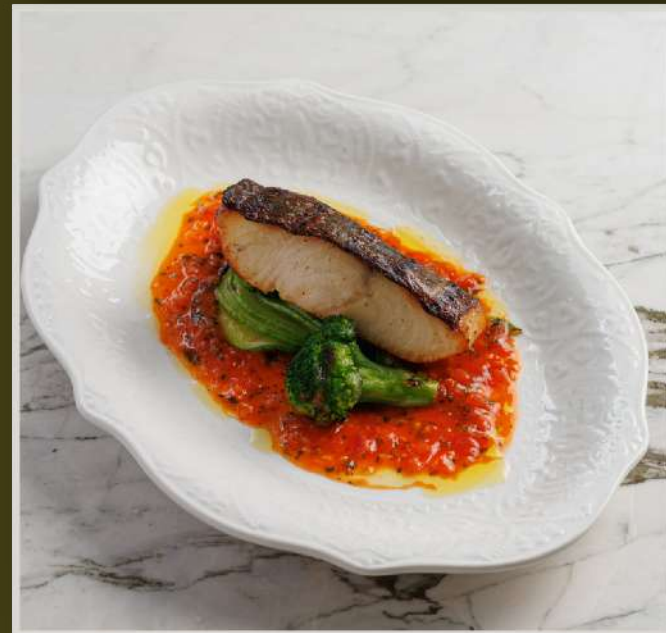
BLACK KOD WITH BAKED TOMATOES