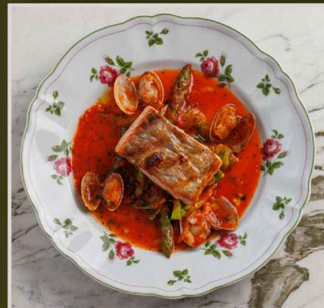
GRILLED SALMON, ROMAINE, ASPARAGUS